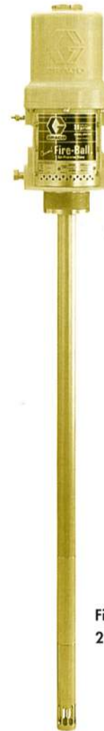
Fire-Ball 50:1 239888 shown